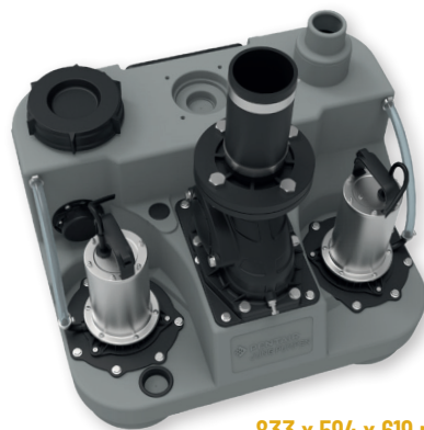
833 x 594 x 619 mm (L x H x W) Code no. JP50087